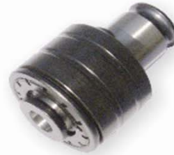
扭力筒夾規格表 Chuck standards and size list